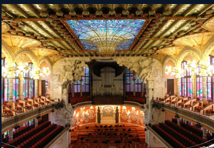
Palau de la Música Catalana