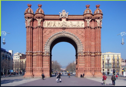
Arc de Triomf