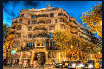
Casa Mila (La Pedrera)