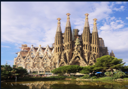
Basilica de la Sagrada Família