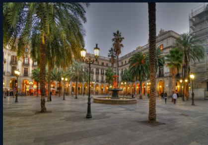
La Rambla Barcelona's Social Hub