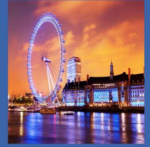
Coca-Cola London Eye