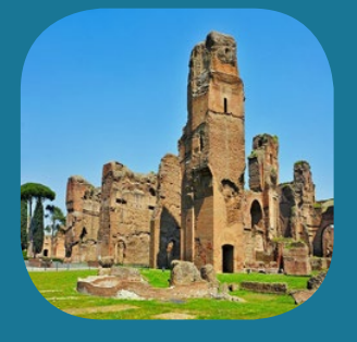
Baths of Caracalla