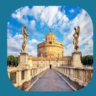
Castel Sant'Angelo National Museum