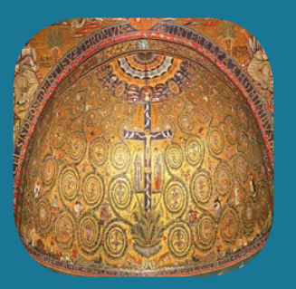
Church of San Clemente