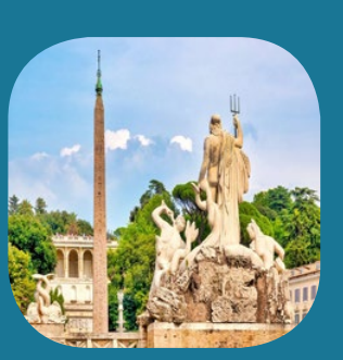
Santa Maria del Popolo