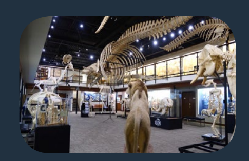
Skeletons Museum of Osteology