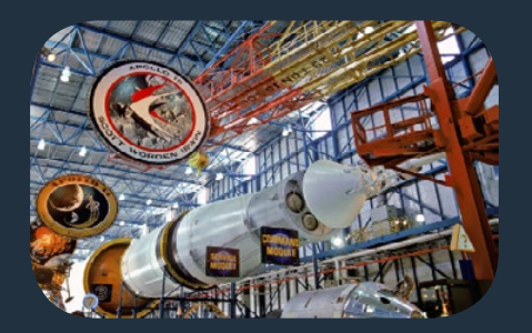
Kennedy Space Center