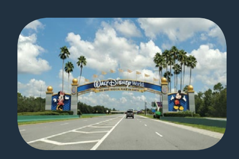
Walt Disney World