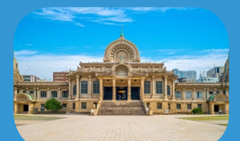
Tsukiji Hongan Ji