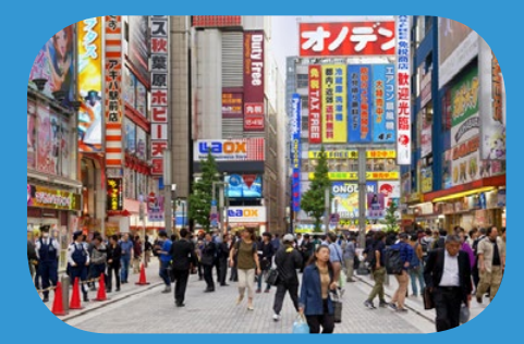
Akihabara Electric Town