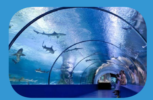
Osaka Aquarium Kaiyukan