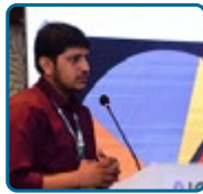
Amir Ashraf Homoeopathy Clinic, India