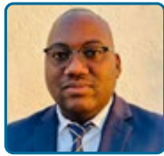
Ruben Shaanika Kanime Intermediate Hospital Oshakati, Namibia