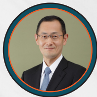
Shinya Yamanaka Kyoto University, Japan