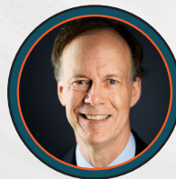
William G. Kaelin Duke University, USA