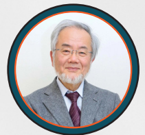
Yoshinori Ohsumi University of Tokyo, Japan