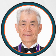
Tasuku Honjo Kyoto University, Japan