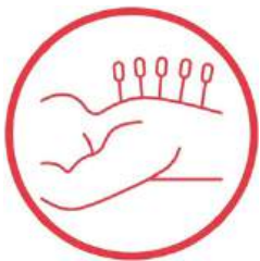
Acupuncture and Dry Needling