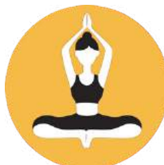
Yoga & Fitness