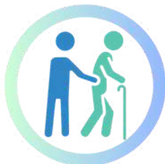
Geriatric Physical Therapy