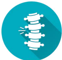
Spinal Cord Injury