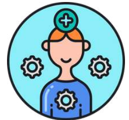
Physical Therapy in Mental Health