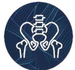
Pelvic floor Rehabilitation