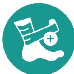
Wound care & Electromyography