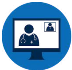
Telehealth and Telerehabilitation