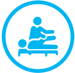
Physical Therapy & Rehab

At Physio 2026, education goes beyond traditional lectures. Our sessions are designed to be immersive, interactive, and impactful , ensuring every participant leaves with new skills, fresh perspectives, and practical knowledge .