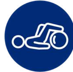
Sports Injury Rehabilitation