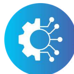
AI and Machine Learning in Physical Therapy