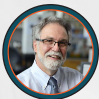
Gregg L. Semenza

Johns Hopkins University School of Medicine, USA